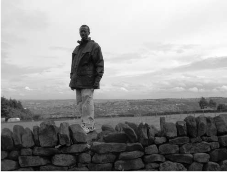
Figure 7. A dry stone wall at Loxley Common.

space can play in providing refugees and asylum seekers with positive experiences of life in the UK. Visiting parks, gardens and urban fringe countryside proved to be a stimulating and enjoyable contrast to many of the participants' everyday routines, and seemed to give them a glimpse of pleasurable aspects of life in the city. For refugees who settle long term in their adopted countries, a sense that the new lifestyle can be rewarding and beneficial to them is vital in enabling them to accept their change of circumstances (Colic-Peisker & Tilbury 2003). This research supports the notion that a positive impression of the local environment, and participation in its leisure opportunities, can be a useful component of building this acceptance. Visiting a range of types of urban greenspace and participating in different activities gave participants an insight into British culture and a growing awareness of recreational norms. Though overcoming barriers to full participation occurs only over time – through building of confidence, friendship networks and economic stability – occasional or frequent use of public open space can aid integration with non-refugee communities. This can be through shared sporting, recreational or entertainment