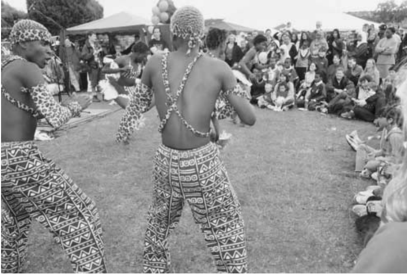
Figure 5. Local community festival with Zimbabwean dancers.

facilities could be one key means of achieving greater integration, especially for male refugees.