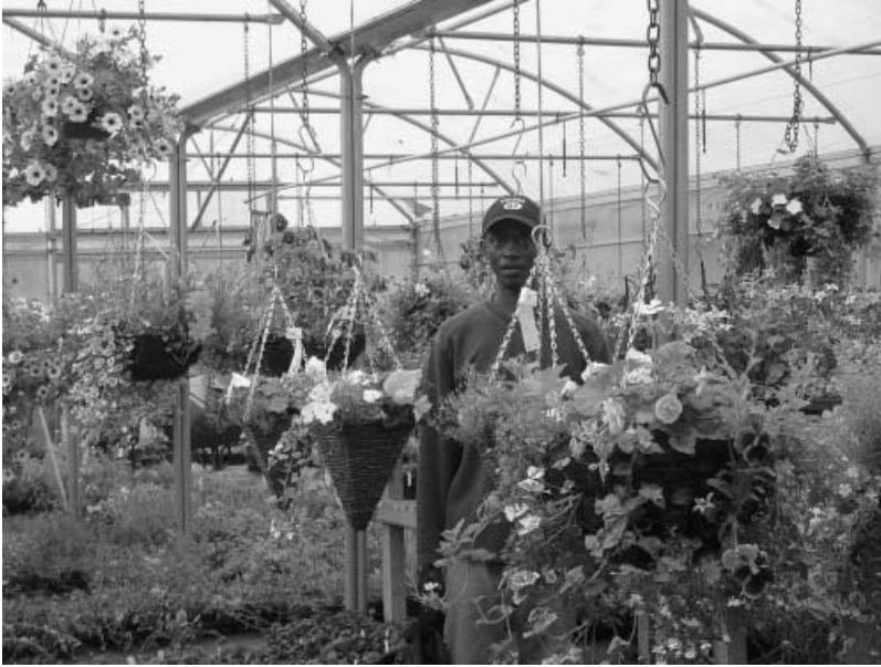
Figure 2. Hanging baskets at Heeley City Farm.

use of specific elements in the parks. Some of these would be considered novel by the designers and most visitors, such as an artificial climbing boulder in the community park, and public artwork such as a carved totem pole. However, some elements which were new to the participants would not normally be seen as unusual within a British context. The concept of providing boxes in trees for birds to live in seemed to simultaneously shock and delight the group and was one memorable moment when the cultural divide between their home countries and the UK was illuminated. Though the group were aware of the purpose of play equipment most had not experienced playing on it before. Once we had assured them that this was allowed they enjoyed the fun of this new opportunity. The collection of hanging baskets in the city farm equally provided them with a source of joy at the beauty of the flowers and was a popular backdrop for photos (Figure 2).