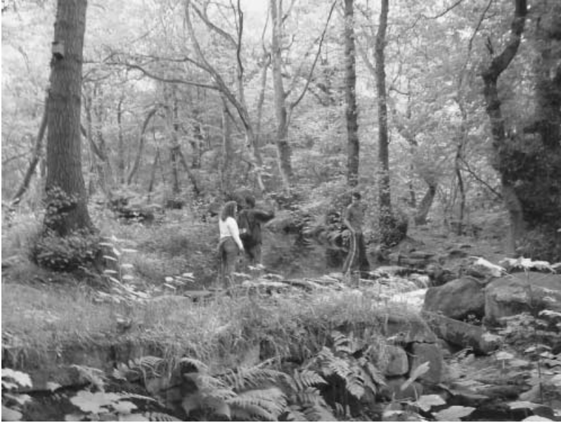
Figure 3. Rivelin Valley: 'It remind me of when I was a little boy and me and my grandfather used to walk in the forest during the rainy season'.

floral displays were startling to the participants not simply because they didn't know that they existed, but because they pointed to a lifestyle where pleasurable aspects of life are able to be publicly valued and freely shared.